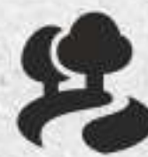
2 Miyawaki Forest