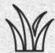
3 Lawn For Functions