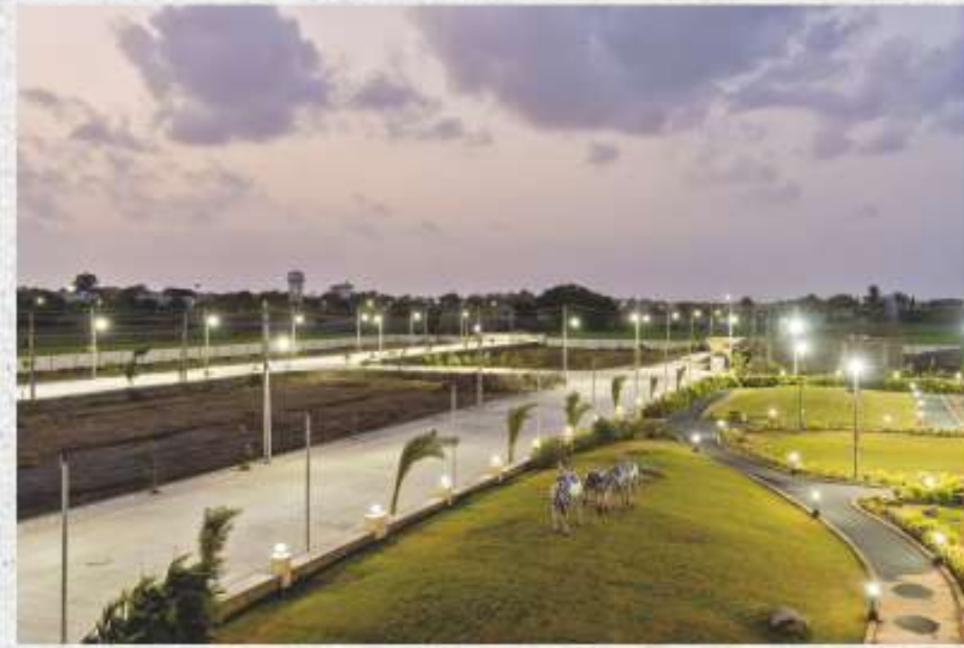
Internal 40 Ft. CC Road