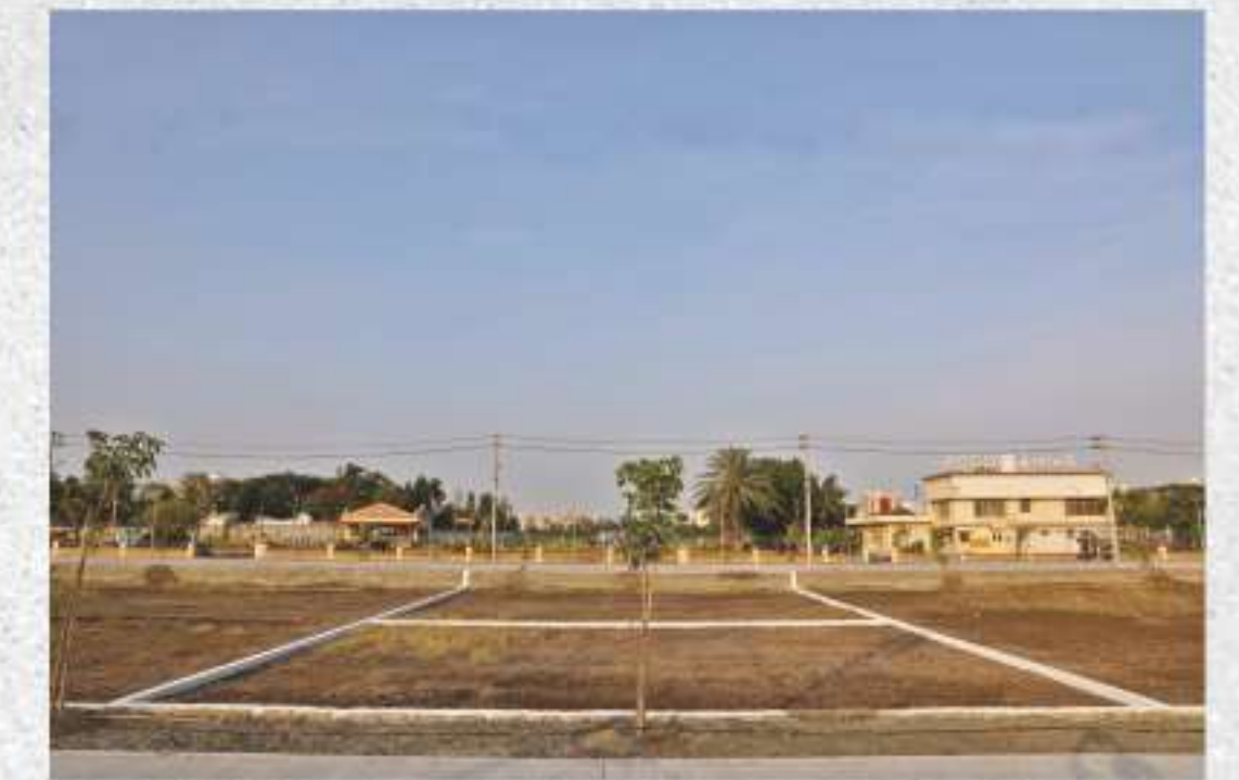
Proper Plot Demarcation