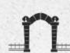
6 Main Gate

LEGAL DISCLAIMER : All the elements, objects, treatment, materials, equipment & colour scheme are artisan's impression & purely for presentation purpose. By no means it will form a part of the amenities, features or specification of our final product. This brochure is intended only for easy display & information of the scheme & does not form part of the legal documents, agreement for sale shall be final & binding to the purchaser.