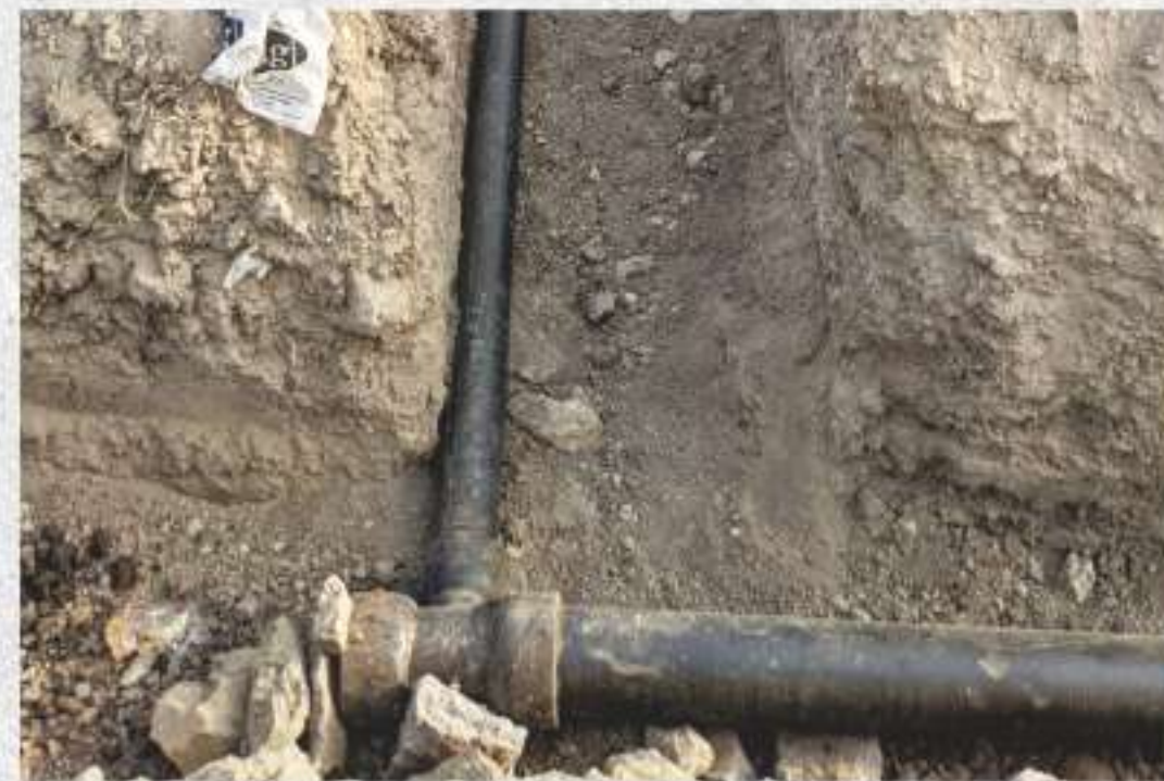
JMC Water Supply