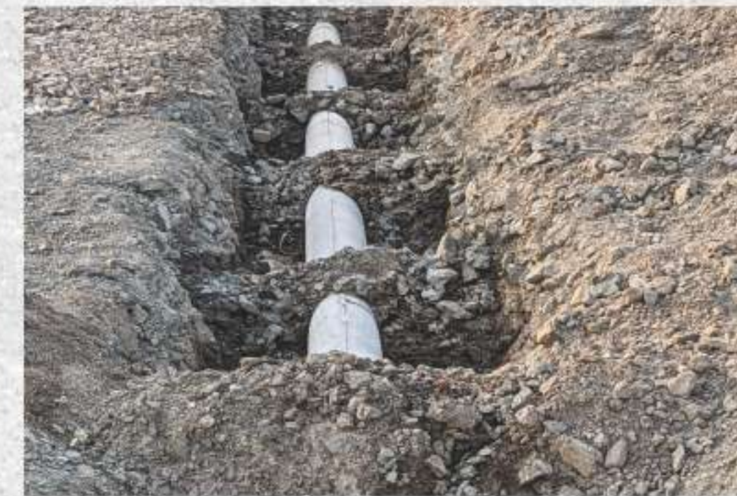
Connected To JMC Drainage