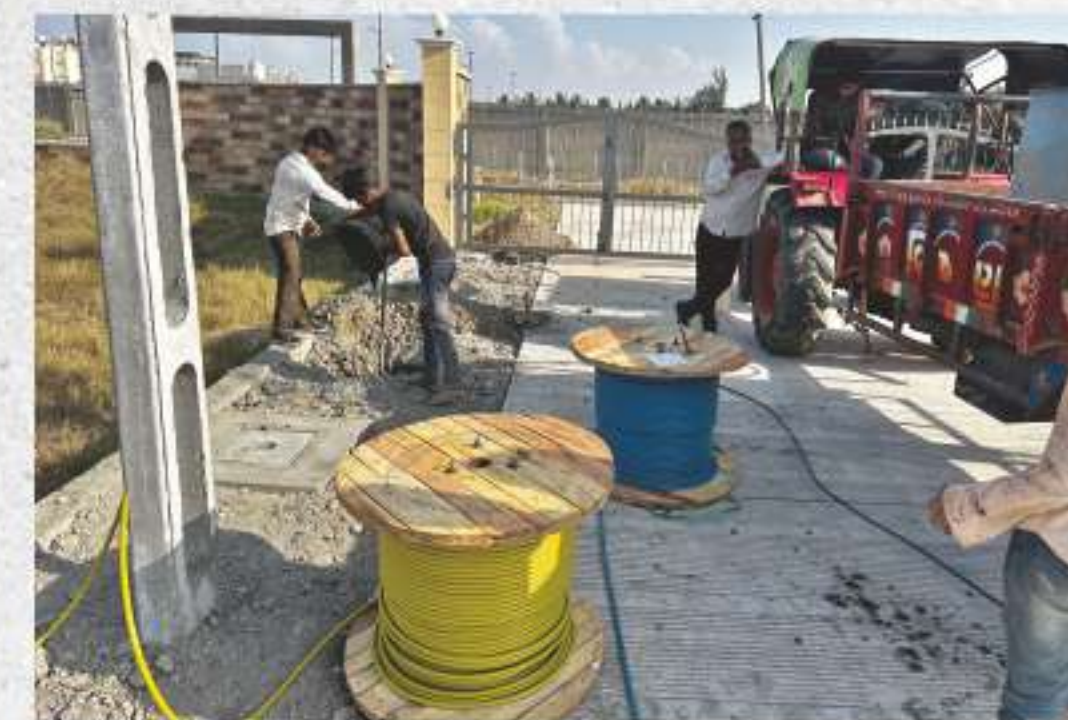
Double-coated Electric Wires