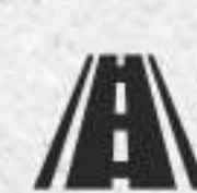
5 40 Ft. Wide Road