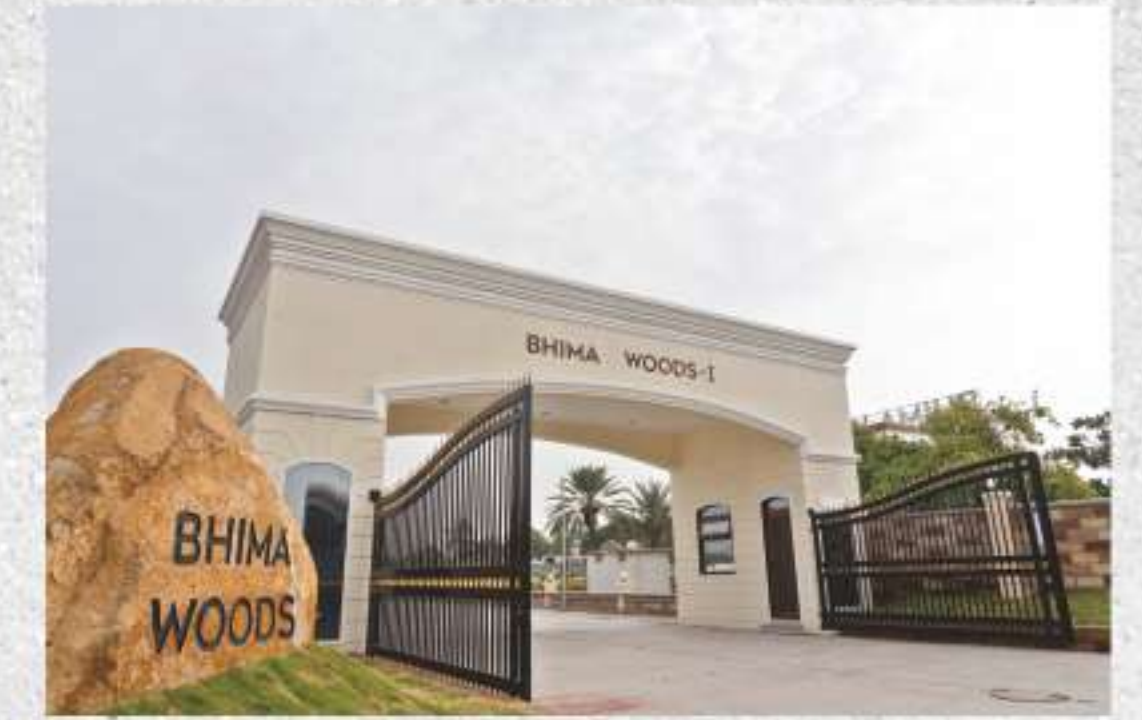
Grand Entry Gate