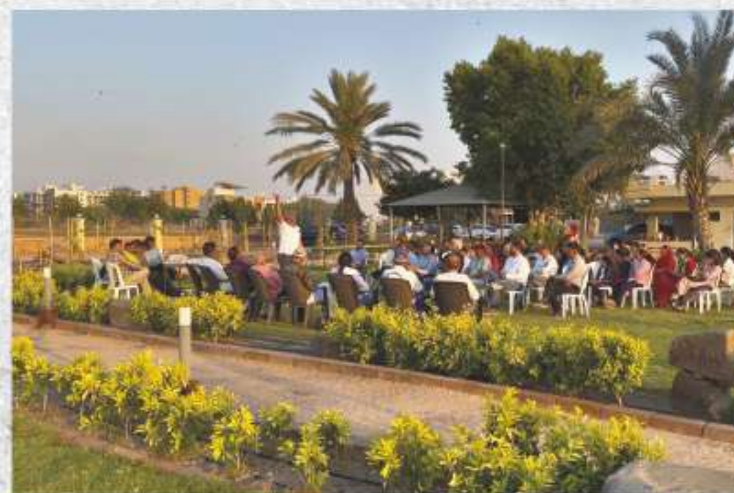
Lawn For Function